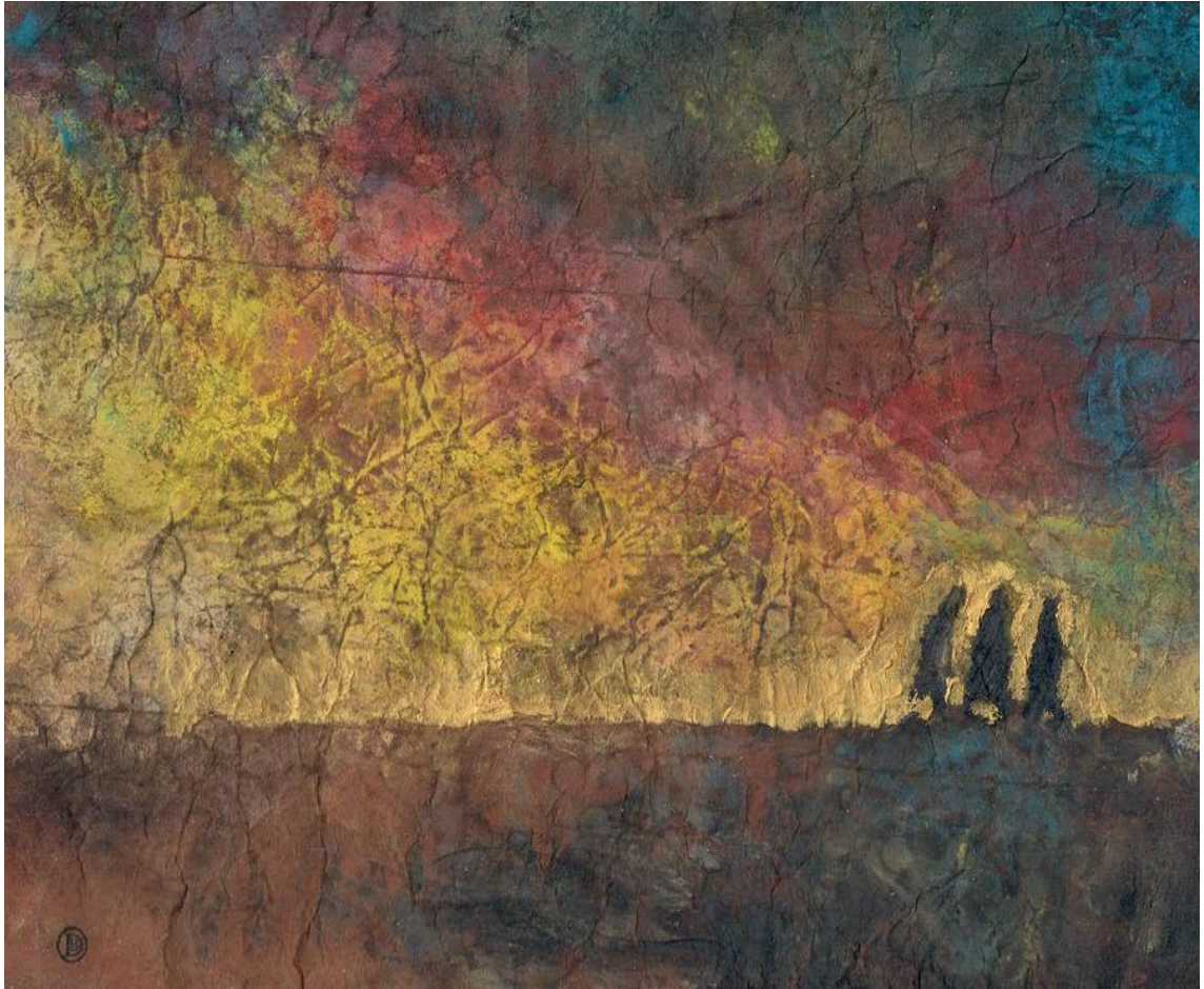
The Road to Emmaus