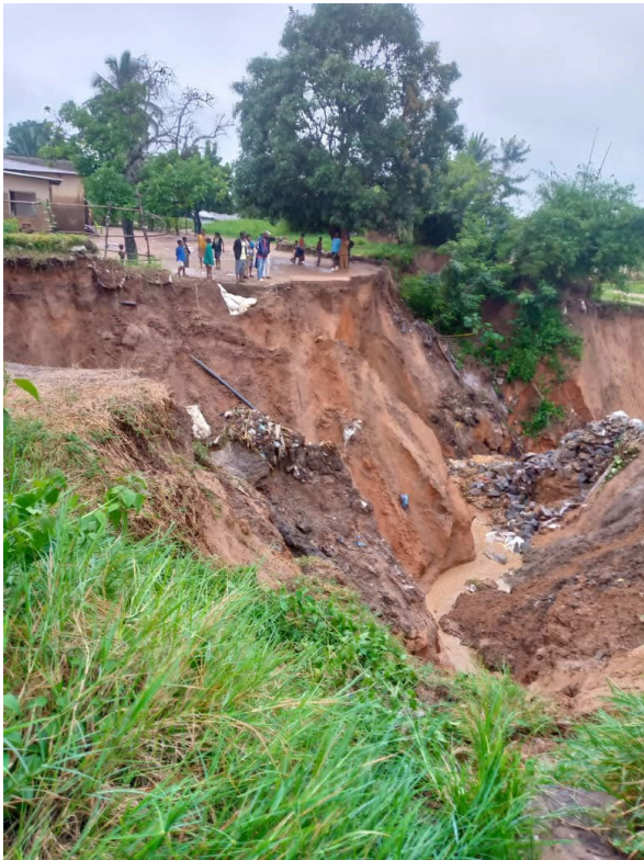
Ravine at Kananga