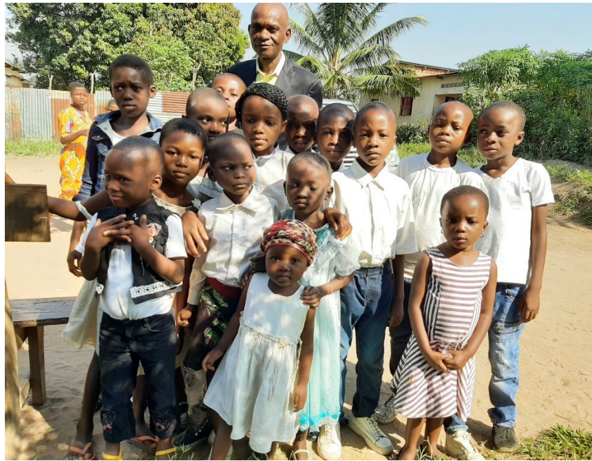
Outside of Dinanga